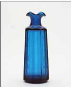
Estimate: $150 - $250 (Minumun bid: $75.00)

Gilt Decorated Decanter , probably Bristol, England, 1790-1820. Translucent cobalt ("Bristol Blue"), club form, gilt decorated "RUM" lettering within fancy decorative hanging urn motif. Tooled flared mouth with correct lozenge type stopper – polished pontil scar, ht. 8 7/8"; (some minor paint loss on stopper and neck ring). BH, plate 42, #9. A good early decanter, absolutely wonderful condition.