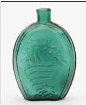
Estimate: $500- $700 (Minumun bid: $350.00)

Sunburst Flask , America, possibly Baltimore Glass Works, Baltimore, Maryland, 1820-1830. Bright medium green with an emerald tone, sheared mouth – pontil scar, half pint; (small 1/16 inch potstone radiation located at the end of a ray near the shoulder, otherwise sparking mint). GVIII-27. A exceptional Sunburst flask, great visual appeal, rare color!