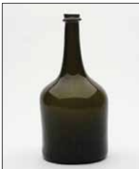
Estimate: $250- $400 (Minumun bid: $150.00)

Black Glass Wine Bottle , England, 1780-1800. Yellowish olive green, squat cylinder form, applied double collared mouth - hummock shaped deep kick-up with a blue opaque hue, sand chip pontil scar, ht. 8 1/4 inches, dia. 4 1/4 (at widest point). Wonderful condition, about mint and with some frothy bubbles and swirls to the glass.