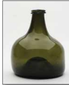
Estimate: $1,500 - $3,000 (Minimum bid: $1,000.00)

Black Glass Shaft and Globe Wine Bottle , England, 1660-1675. Olive green, shaft and globe form, sheared mouth, applied string lip – glass-tipped pontil scar, ht. 8 1/2", body dia. 5 1/4"; (a couple of minor flakes off edge of mouth, the largest being approx. 3/8" by 1/4"). Van den Bossche, plate #6. Wonderful example and outstanding condition with full original body luster. Ex. Tom Floyd collection.