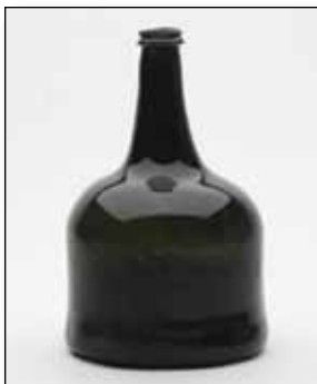
Estimate: $175 - $350 (Minumun bid: $125.00)

"A.S. / C.R" (on applied glass seal), Black Glass Wine Bottle , England, 1770-1790. Olive green with an amber tone, cylinder form, applied and tooled string lip - pontil scarred base, ht. 11 1/8 inches, perfect. An outstanding example of this classic All Souls Common Room sealed bottle.