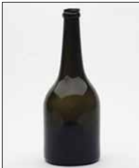
Estimate: $100 - $150 (Minumun bid: $50.00)

"M" (on applied glass seal), Black Glass Wine Bottle , England, 1790-1810. Clear olive green, half-size cylinder form, applied mouth - domed shaped push-up base, sand chip pontil scar, ht. 8 3/8 inches; dia. 2 3/4 inches. Unusual size, very attractive, pristine cellar found condition.