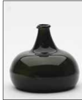
Estimate: $500 - $1,000 (Minimum bid: $300.00)

Black Glass Transitional Mallet Form Wine Bottle , probably England, 1725-1735. Yellowish olive green, straight sided onion form transitioning to an early mallet form, applied string lip – sand or disc type pontil scar, ht. 7 1/4", body dia. 5 1/2"; (a 1/4" chip or area of roughness at edge of lip and some light outside scratches, but with full original body luster.). A somewhat scarce form.