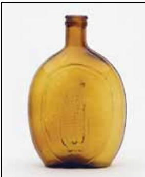
Estimate: $2,000 - $3,000 (Minumun bid: $1,000.00)

Scroll Flask , America, 1850-1860. Aquamarine, applied double collared mouth – iron pontil scar, pint. GIX-11. A very attractive scroll with a somewhat unusual applied double collar.