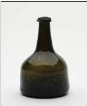
Estimate: $500 - $1,000 (Minimum bid: $300.00)

Black Glass Onion Form Wine Bottle , England, 1700-1720. Olive green, onion form, applied string lip – sand chip type pontil scar, ht. 5 7/8", body dia. 6"; (overall exterior etching and interior stain or residue, and a couple of minor 1/8" surface only, body nicks or iridescent flakes. However the string lip is perfect and there is no other form of damage).