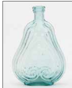
Estimate: $100- $200 (Minumun bid: $50.00)

Cornucopia – Urn Pictorial Flask , Lancaster Glass Works, Lancaster, New York, 1849-1860. Rich blue green, sheared mouth – pontil scar, pint. GIII-17. A pretty color and a good solid example of this popular flask.