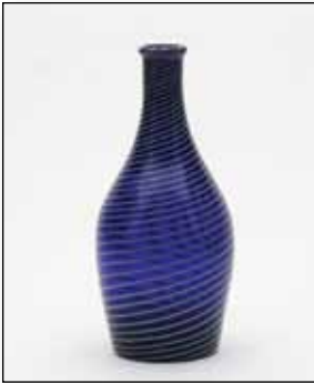
Estimate: $150 - $300 (Minumun bid: $100.00)

Early Victorian Decanter , England, 1840-1860. Bright yellow apple green, slightly tapered ovoid form with 13 flat polished body panels, heavy applied neck ring and sheared, polished and slightly flared mouth with correct matching blown stopper – polished pontil scar, ht. 11 1/8 inches (not including stopper). A substantial and visually appealing early decanter.