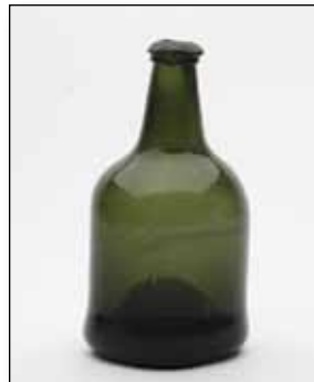
Estimate: $75 - $150 (Minumun bid: $50.00)

Black Glass Wine Bottle , probably Continental, Netherlands, Germany or Belgium, 1760-1780. Olive green, cylindrical long necked utility form, sheared mouth with applied band - deep kick-up base, sand chip pontil scar, ht. 10 1/8 inches, dia. 3 3/4 inches (tiny "star" type fissure with 1/4" legs near shoulder). Near-full original gloss and some bubbles and undissolved streaks adding to it's charm.