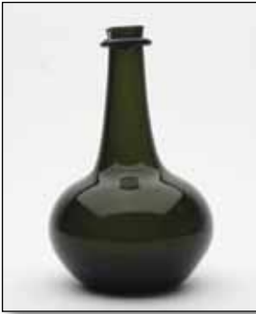
Estimate: $5,000 - $10,000 (Minimum bid: $2,500.00)