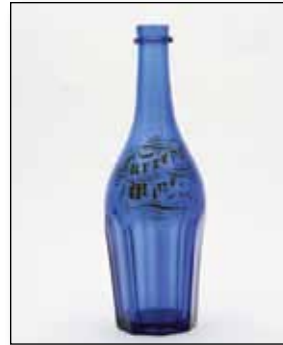
Estimate: $150 - $300 (Minumun bid: $100.00)

Fancy Decanter or Table Serving Bottle , probably Norwegian, 1830-1850. Rich cobalt blue with fine opaque white spiral threading, bulbous form, tooled ring type mouth – pontil scar, ht. 8 1/4 inches. Similar to VdB plate #241. A fine early attractive decanter.