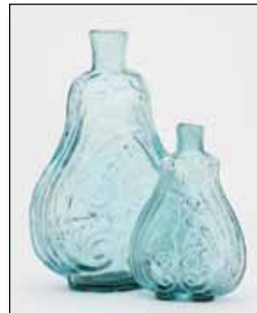
Estimate: $150 - $250 (Minumun bid: $100.00)

“Baltimore” / Monument – “Corn For The World” / Ear of Corn Historical Flask , Baltimore Glass Works, Baltimore, Maryland, 1860-1870. Yellow apricot, applied double collared mouth – smooth base, quart. GVI-4. A Big splash of color, fine condition. Ex. NCH Auction #16, lot 80.