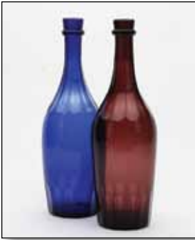
Estimate: $250 - $500 (Minumun bid: $150.00)