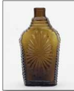
Estimate: $2,000- $4,000 (Minumun bid: $1,000.00)

Cornucopia – Urn Pictorial Flask , New England, possibly Keene Marlboro Street Glass-works, Keene, New Hampshire, 1825-1842. A pure “seedy” olive green, sheared mouth – pontil scar, half pint; (an easy to overlook ½ inch flake is located at edge of base on the reverse). GIII-7 A wonderful example filled with tiny seed bubbles, very strong mold impression, crocked neck, and virtually no high point wear.