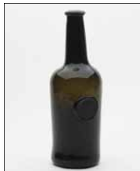
Estimate: $150 - $250 (Minumun bid: $100.00)

Black Glass Utility or Wine Bottle , possibly Continental, 1735-1750. Yellowish olive green, mallet form with slightly drawn up shoulders, applied string lip - shallow concave or slightly domed base, sand chip pontil scar, ht. 8 3/4 inches, dia. 4 inches; (1/8 inch flake off edge of mouth and only very minor high point wear, otherwise about mint). Wonderful overall condition.