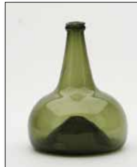
Estimate: $125 - $225 (Minumun bid: $75.00)

Fancy Engraved Decanter, probably Continental , 1870-1890. Bright peacock blue, octagonal form with cut and polished body panels tapering slightly towards the shoulders, engraved wreath design, tooled and flared double pour lip – polished flat base, ht. 9 inches. Lovely color, unusual form.