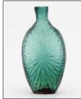
Estimate: $1,500 - $3,000 (Minumun bid: $1,000.00)

Lot of Two Cornucopia – Urn Pictorial Flasks , New England, 1830-1845. Yellow olive amber and olive amber, sheared mouths – pontil scarred bases, pint and half pint; (the half pint is about mint, the pint has a ¼ inch thin flat flake off the side of the mouth and a surface-only bruise on the side near the base). GIII-4 & GIII-10. An attractive pair.