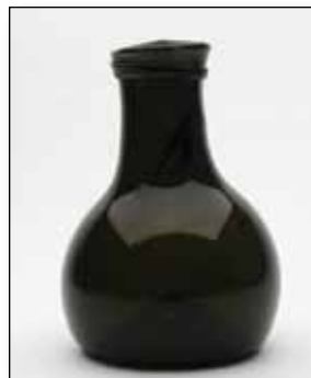
Estimate: $150 - $300 (Minumun bid: $100.00)

Black Glass Mallet Form Wine Bottle , England, 1730-1740. Medium to deep olive green, mallet form, applied string lip - large hummock shaped kick-up, ht. 8 inches, dia. 5 inches; (some light scattered scratches and dullness on exterior; some minor content residue on interior). Some minor dullness on exterior as noted. Retains a perfect string lip and overall fine condition.