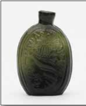
Estimate: $100 - $150 (Minumun bid: $50.00)