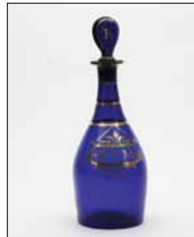
Estimate: $250 - $500 (Minumun bid: $150.00)

Blown "Brandy" Decanter , England or possibly Ireland, 1810-1840. "Brandy" engraved at shoulder, beautiful deep blue green, squatty tapered cylinder or club form, tooled and slightly flared mouth with metal ring type stopper – polished pontil scar, ht. 9 1/4" (excluding stopper). A wonderful early blown decanter.