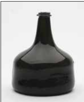
Estimate: $250- $450 (Minimum bid: $125.00)

Black Glass Onion Form Wine Bottle , England, 1690-1710. Olive green, onion form, applied string lip – sand chip pontil scar, ht. 5 1/2", body dia. 6"; (a few scattered surface scratches, otherwise perfect). There is a discernable horizontal ring, possibly resulting from the use of a dip mold, approx. 1" up from the base. A superb example, 100% original luster.