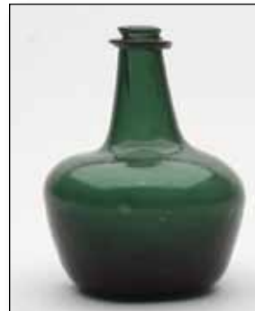
Estimate: $2,000 - $4,000 (Minimum bid: $1,000.00)

Half Size Black Glass Mallet Wine Bottle , England, 1725-1735. Yellowish olive green, mallet form, applied string lip - hummock shaped kick-up, sand chip pontil scar, ht. 6 1/4", dia. 4". Very appealing with charming bubbles scattered throughout the glass. Another superb example. Cellar found condition with 100% original luster, wonderful diminutive size. Ex. Tom Floyd collection.