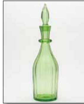
Estimate: $200 - $400 (Minumun bid: $150.00)

Set of Two Blown and Cut, Tall Fancy Decanters , England or America, 1840-1870. Clear plum amethyst and sapphire blue, tall slender ovoid form with polished fluting around the shoulder and base (plum decanter has 12 panels, sapphire decanter, 10), both have sheared mouths with applied rings (mouths have been ground to receive a stopper) – polished pontil scarred bases, ht. 11 3/8". Beautiful set.