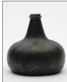
Estimate: $300 - $600 (Minimum bid: $200.00)

Black Glass Mallet Form Wine Bottle , English, 1725-1735. Deep olive green, early mallet form with shoulders slightly narrower than base, sheared mouth with applied string lip – pontil scar, ht. 6 3/4", dia. 5 1/4"; (several flakes off lower and upper portion of string lip ranging between 1/8 & 3/8" each, a 1/2" by 1/8" open bubble at shoulder, interior has some dried contents or haze). Full original body luster.