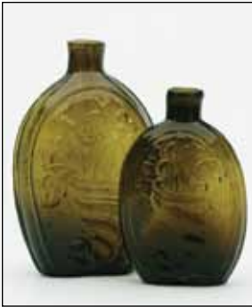
Estimate: $150 - $250 (Minumun bid: $100.00)

Sunburst Flask , probably Pitkin Glass Works, Manchester, Connecticut, 1815-1825. Golden olive amber, sheared mouth – pontil scar, pint; (a tiny pinhead area of roughness on the inside edge of the mouth that may have occurred in manufacture and is fairly inconsequential, faint bit of high point wear, otherwise about mint). GVIII-5a. A rare early Connecticut Sunburst flask that does not come along often. Ex. Robert Marocco.