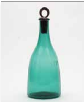
Estimate: $250- $500 (Minumun bid: $150.00)

Blown Molded Bar Decanter , probably England, 1850-1880. "Current Wine" painted on shoulder in Old English style lettering. Sapphire blue, tall ovoid form with eight molded flutes around body, sheared and tooled mouth with applied ring – polished pontil scar, ht. 11 1/8 inches; (the decanter is about mint, some paint loss on the lettering and design).