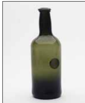
Estimate: $250 - $500 (Minumun bid: $150.00)

"N.B /Dursley / 1783" (on applied glass seal), Black Glass Wine Bottle , England, 1783-1785. Olive amber, early squat cylinder form, applied string lip - domed or pushed up base with sand chip pontil scar, ht. 9 1/4 inches; dia. 4 inches; (small area of light haze or content residue, otherwise about perfect). An absolutely wonderful early dated seal bottle in cellar-found condition.