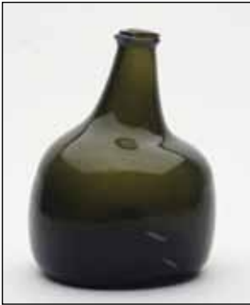
Estimate: $300 - $600 (Minimum bid: $150.00)

Oversized Wide Mouth Mallet Black Glass Bottle , England, 1725-1735. Yellowish olive green, early mallet form preserving or storage bottle, wide mouth with applied string rim - large hummock shaped kick-up, sand chip pontil scar, ht. 9", dia. 7 5/8". A stunning bottle, absolutely remarkable condition, full original body luster. Ex. Tom Floyd collection.