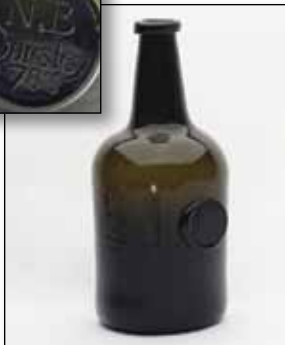
Estimate: $1,250 - $2,500 (Minumun bid: $750.00)